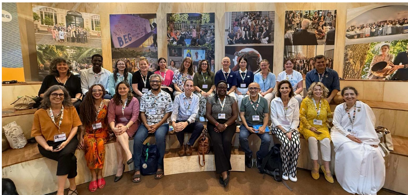
Women, Faith and Climate Network side event in Global Ethical Stocktake Pavilion