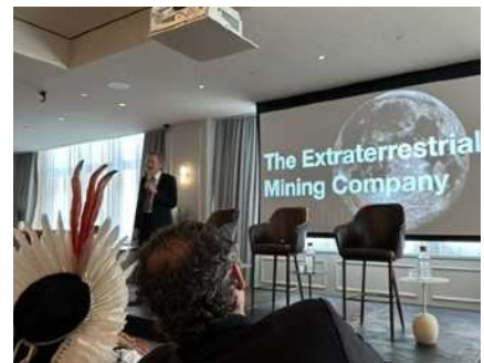
With Her Excellency Sônia Guajajara Minister of Indigenous Peoples, Federal Government of Brazil attending the event Leaders with Purpose