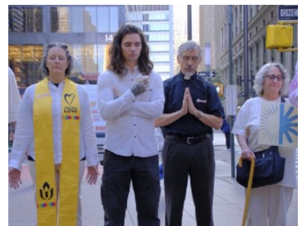
BK Sabita attending the opening prayer ceremony at UNHQ