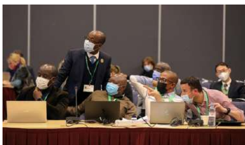
Delegates conferring during a contact group on the post-2020 global biodiversity framework