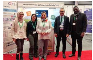
Meeting with Sahara and Sahel Observatory.