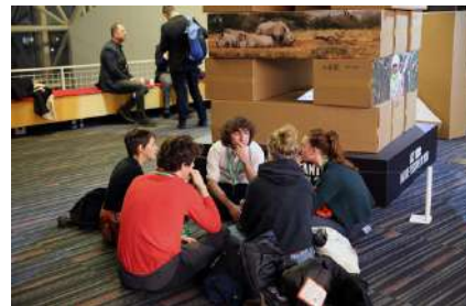
Discussions around the venue.