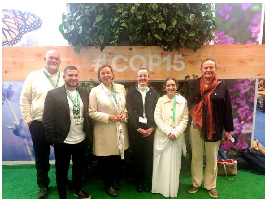
at the conference venue - Palais des Congrès de Montréal