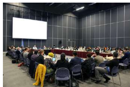
View of the room during a contact group on the post-2020 global biodiversity framework