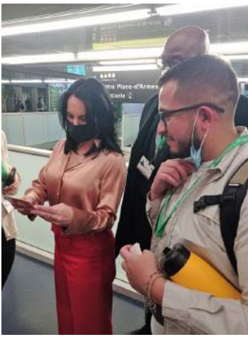
With Valérie Plante, the Mayor of Montreal,