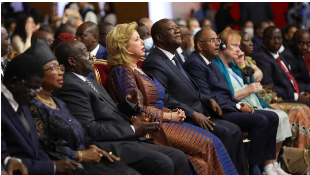
Dominique Ouattara, First Lady of Côte d'Ivoire, and Alassane Ouattara, President of Côte d'Ivoire, join dignitaries for the opening ceremony