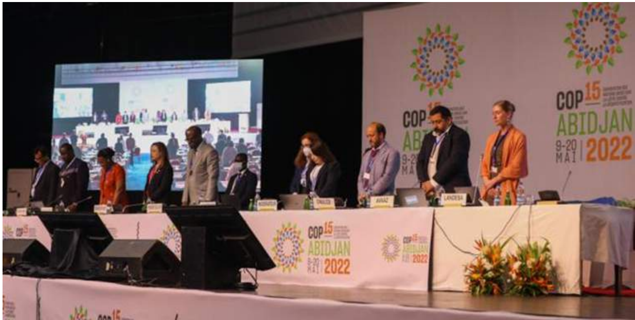
Delegates observe a moment of silence to recognise 'land heroes who died