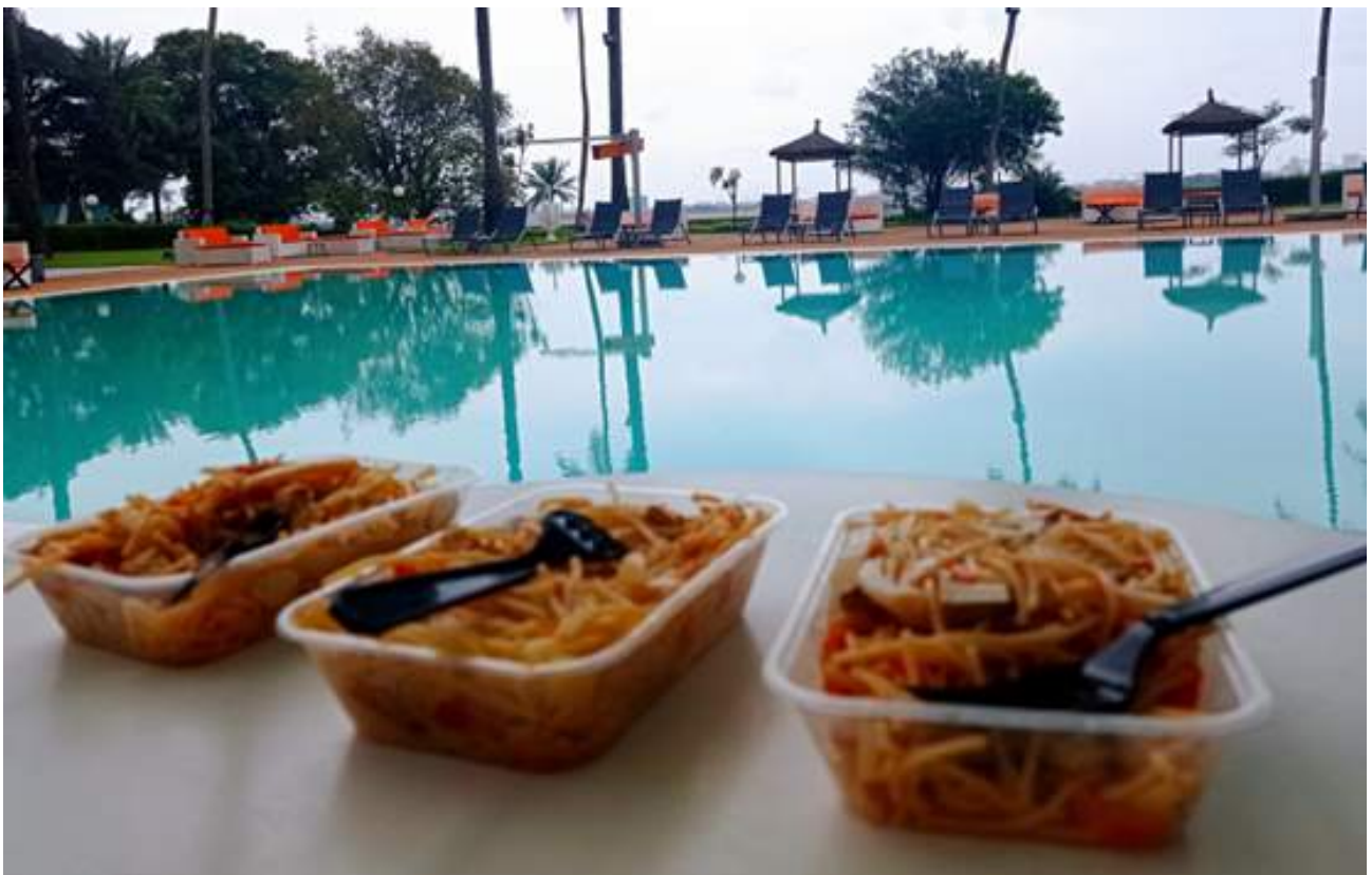
We had our vegan pack lunch at the hotel's poolside