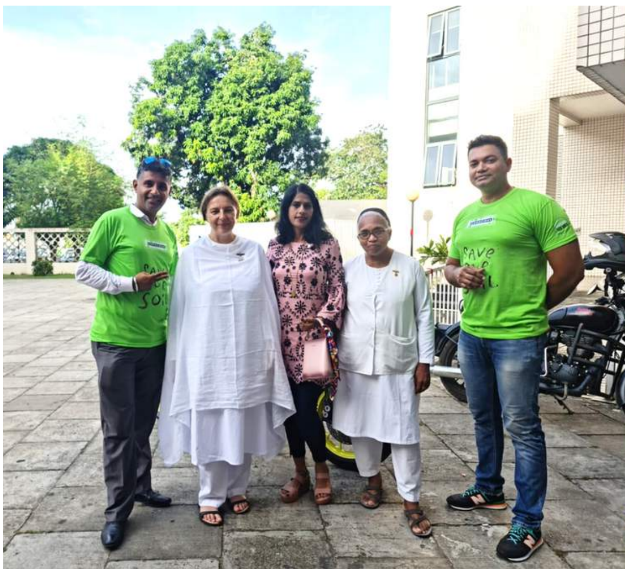
Before the "Save Soil event.