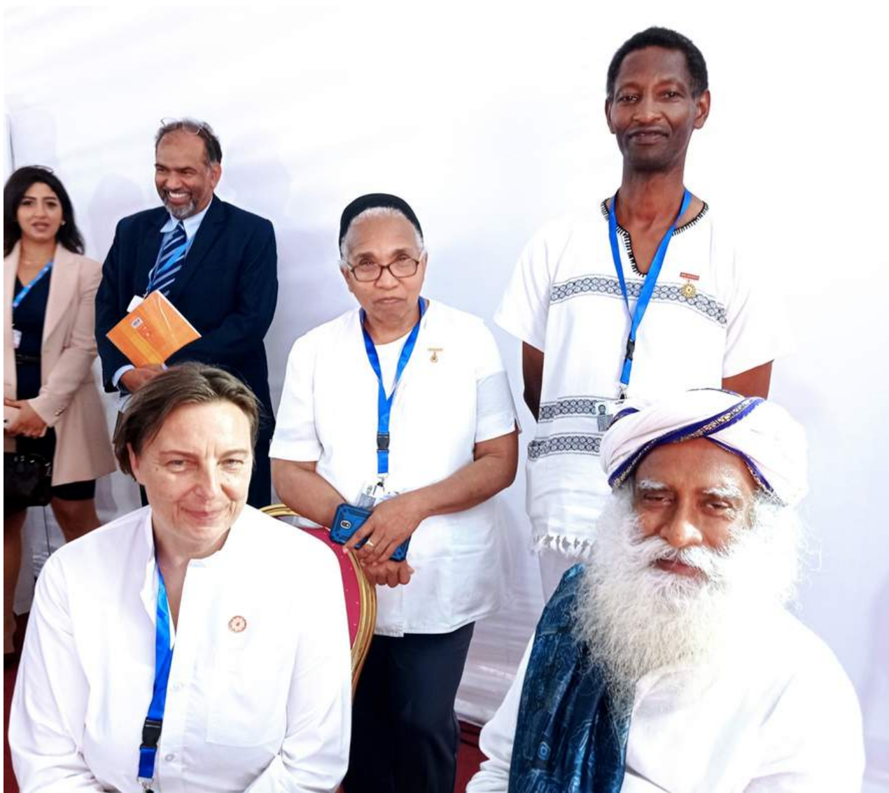
BK delegates meet Sadhguru

Side event - 'Save Soil' campaign initiated by Sadhguru.