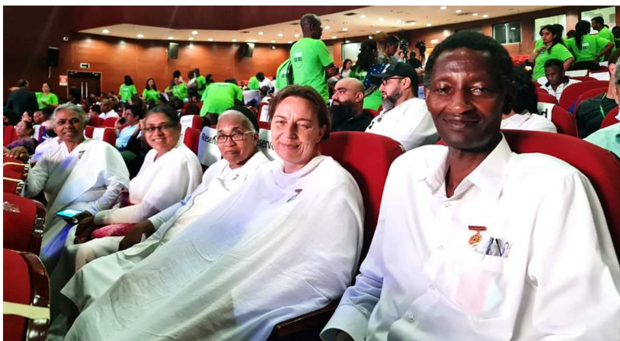
During the programme