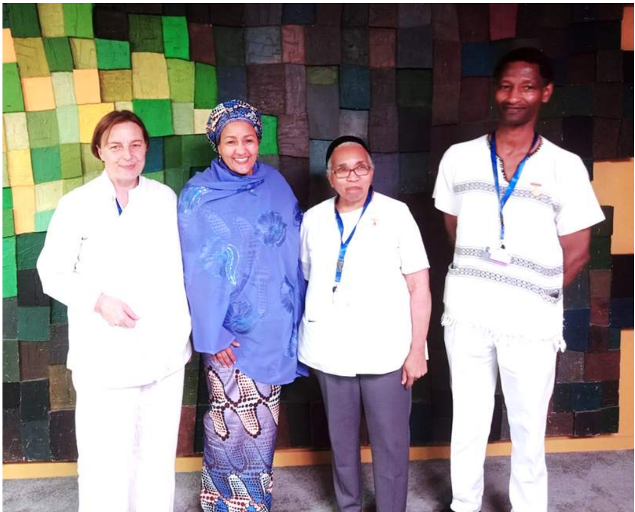
We met with The Deputy Secretary General of the United Nations Amina Mohammed after the Gender Caucus meeting.