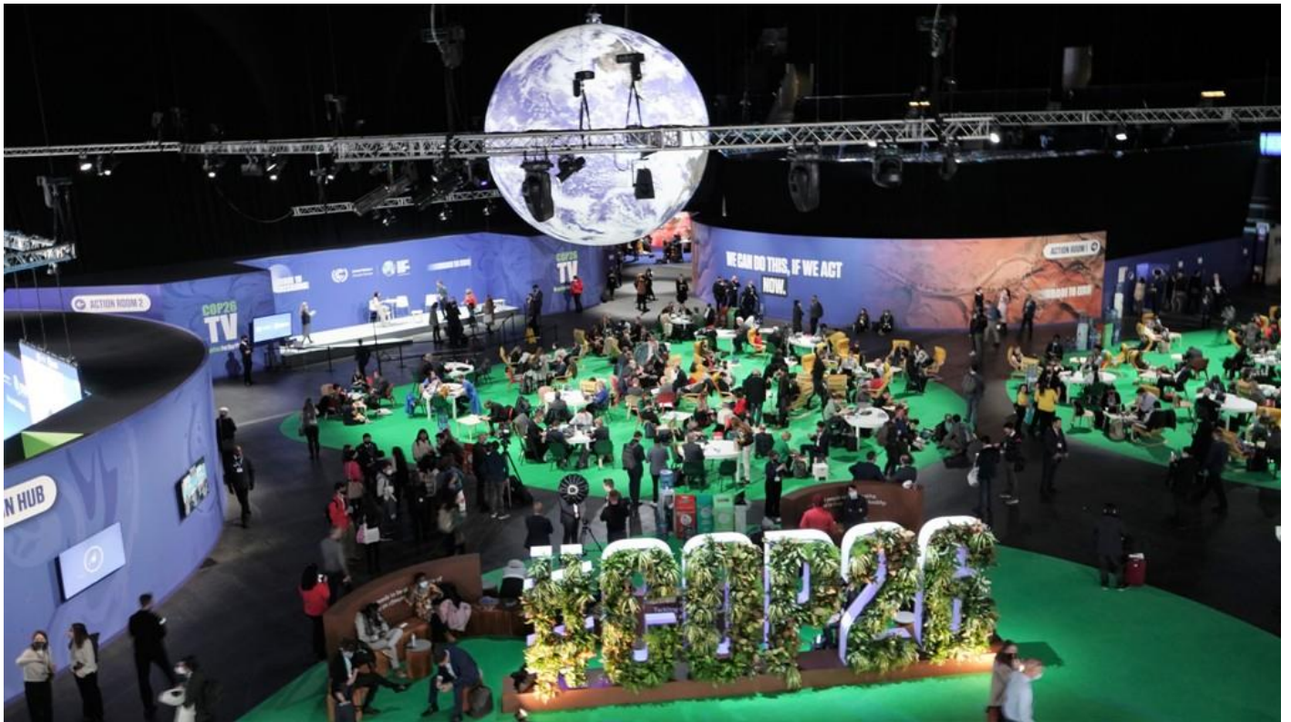
Impression from the Action Zone