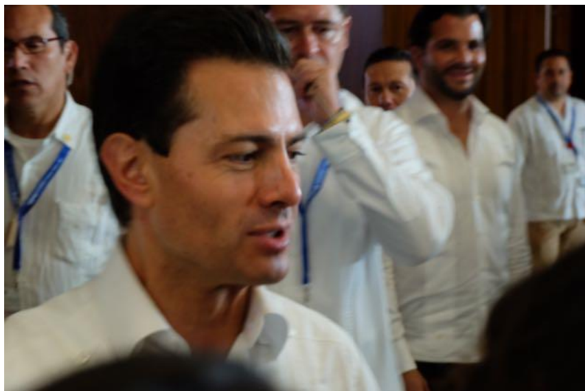
Picture 2. Enrique Peña Nieto, President of Mexico, leaving the premises after the opening ceremony.

The Mexican president welcomed the delegates. He encouraged them to learn from the past and work together to preserve the biodiversity of the world. He reminded everyone that to preserve this diversity is not only the correct thing to do, it is also ethical and moral. He ended his speech saying: "We need to change our ways of living to preserve the biodiversity or else the loss of biodiversity will change our ways of living forever".