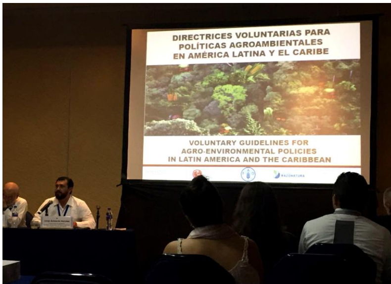
Picture 4. Ministers from the Mexican government.

The ministers from the Mexican government shared their efforts and decisions to preserve the environment.