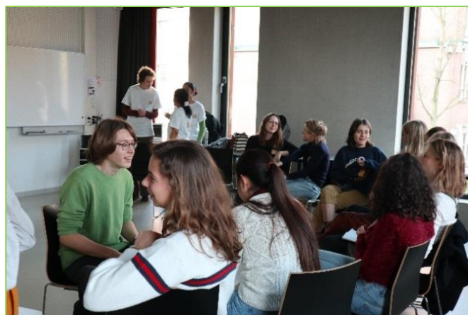
Some highlights from the workshop

Overall the students were well informed, organised, aware, exploring the new avenues towards their contribution to climate change, consciously motivated and active. However, we also observed the underlying overload of information and the dilemma and anxiety on the uncertainty of future aspects.