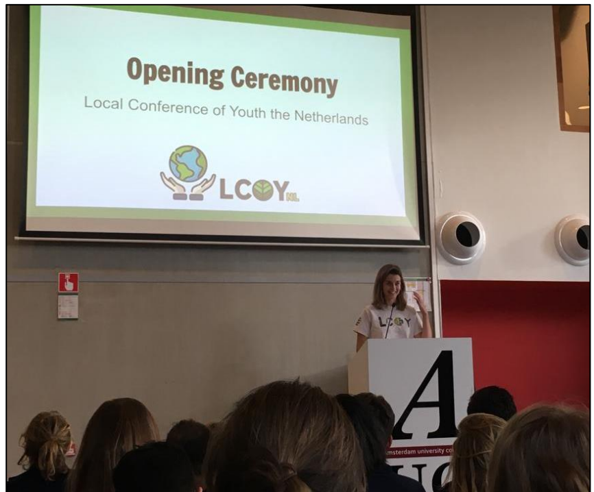
The opening ceremony of the LCOY NL

The workshop on the IPCC report shared some surprising scientific facts. For example: to limit the climate change temperature increase to 1.5 C is difficult and the temperature might even increase to 3 C. In general, it widened our knowledge about the different kinds of activism taking place in the environmental sector. It made us aware of the needs and points of concern of the participants.