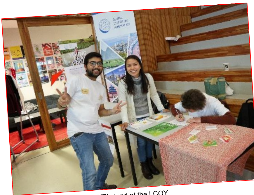
BKEI stand at the LCOY