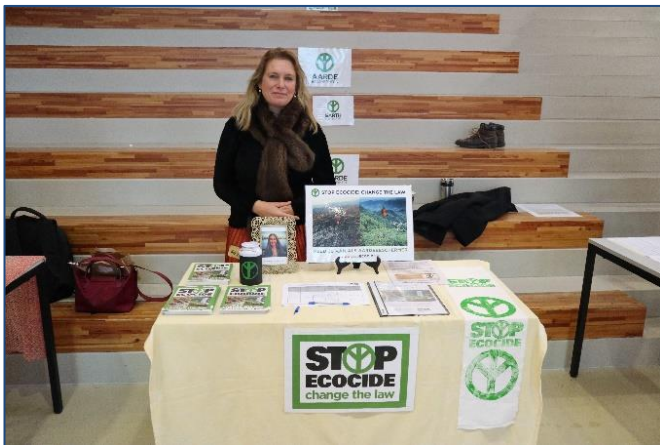
"Stop Ecocide" Environmental Campaign