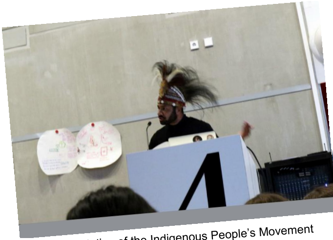
Representative of the Indigenous People's Movement from Papua New Guinea