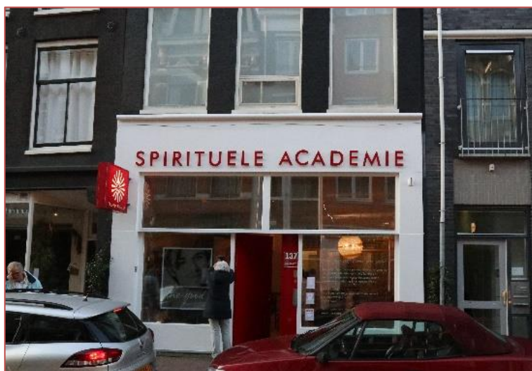
The Brahma Kumaris Centre in Amsterdam