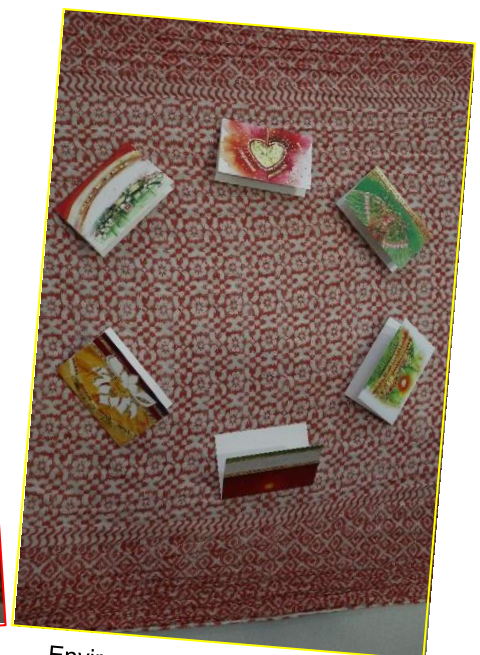
Environmental Blessing Cards