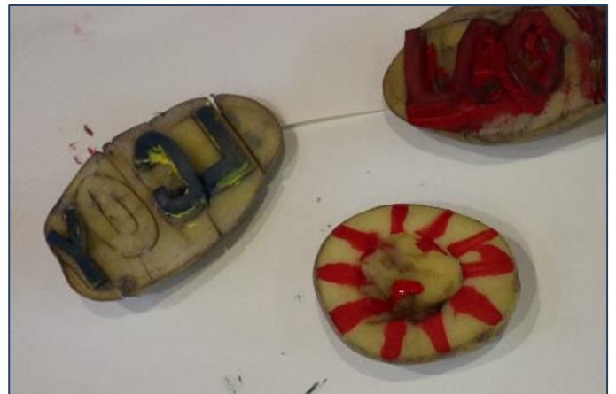
Potato Artwork at LCOY