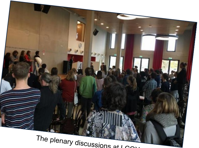
The plenary discussions at LCOY

The format of the LCOY was very open. In the afternoon, they organized a plenary session with all the participants. We were divided into 10 big themes including Rail to the COP, Indigenous People's Movement in Climate Change, Mental Health and Climate Change and so on.