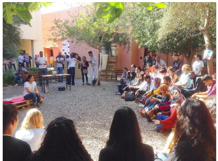
Youth meditating at the Oasis of Peace