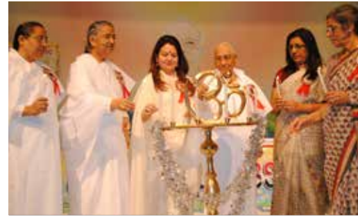
National Woman Conference 2013.

tribal women by providing items of basic need like blankets, utensils, clothes etc. from time to time.