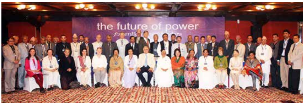
A Leader's Dialogue Series, "Future of Power" program has been organised in more than 57 cities.