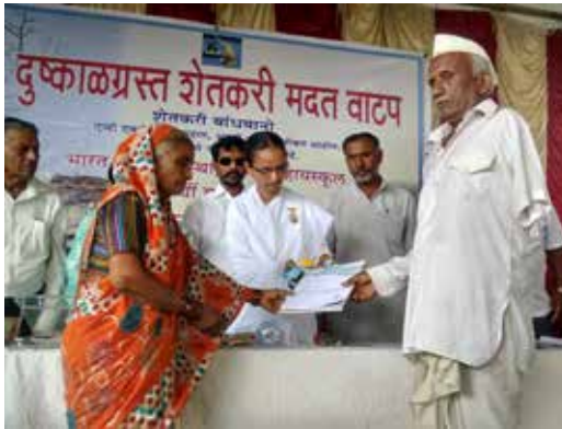
Farmer Empowerment & Support Campaign.

Brahma Kumaris is working in partnership with Government institutions, NGOs and research institutions to empower millions of farmers to reconsider methods of crop protection and to improve methods of agricultural production. Rural Development Wing was established in 1995 to streamline these efforts.