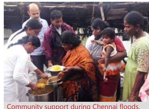
Community support during Chennai floods.

About 17 damaged structures were rebuilt and necessary transport assets and livelihood assets were distributed among the locals. Temporary shelters were built and mobile clinic vans were stationed in several districts that continued to serve until 2006.