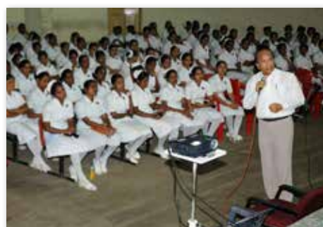
Lecture session for nurses.