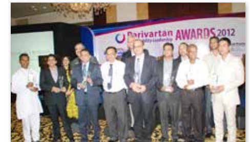
Parivartan Award by Indian Business Committee