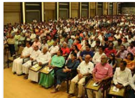
Diabetes Prevention Campaign.