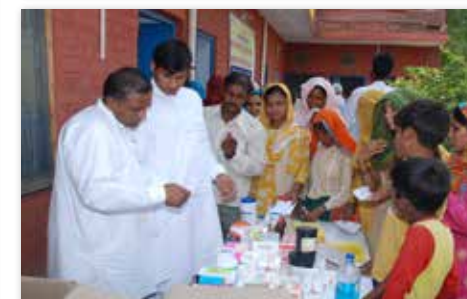
De-addiction Camp in villages.