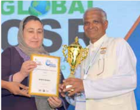
Best Water Management Practices award from Massouda Jalal, Ex-Women Minister, Afghanistan