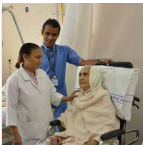
Patient care in Global Hospital.