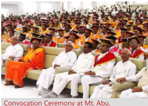
Convocation Ceremony at Mt. Abu.

The first course was launched in 2009 at Annamalai University and today 12 Universities, including the University of the West Indies at Trinidad & Tobago, are running such courses in collaboration with Brahma Kumaris.