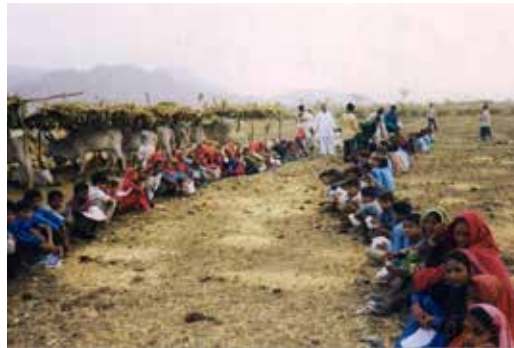
Community service during famine in Rajasthan.

also sent for flood relief operations in Uttarakhand in June 2013. In 2014, when the road link to Kashmir valley was cut off by disastrous floods, all relief material was routed through the local Brahma Kumaris center.