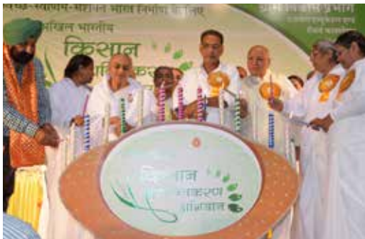
Farmer Empowerment & Support Campaign.

A total of 96 campaigns were organized in 12,822 villages in 293 districts of 19 states across the nation. Our volunteers travelled over 1,01,162 km over a period of 3 months to benefit more than 74,76,035 individuals through 8,30,548 programs.