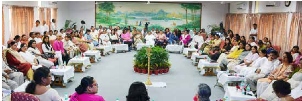
Women's Dialogue on discussing crucial issues like Health, Safety and Empowerment.

Many single women are able to send their children to school because of these jobs. The organization supports the families of