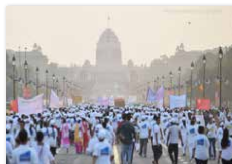
'Run for Health' marathon, Delhi.