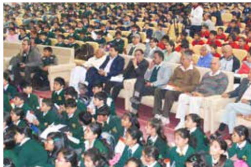
Students attending a workshop at ORC.

More than 4,000 seminars, 1,200 Positive Change Courses and 1,500 Youth Empowerment Camps and 3,600 Value Workshops were organized in thousands of schools and colleges across the country.