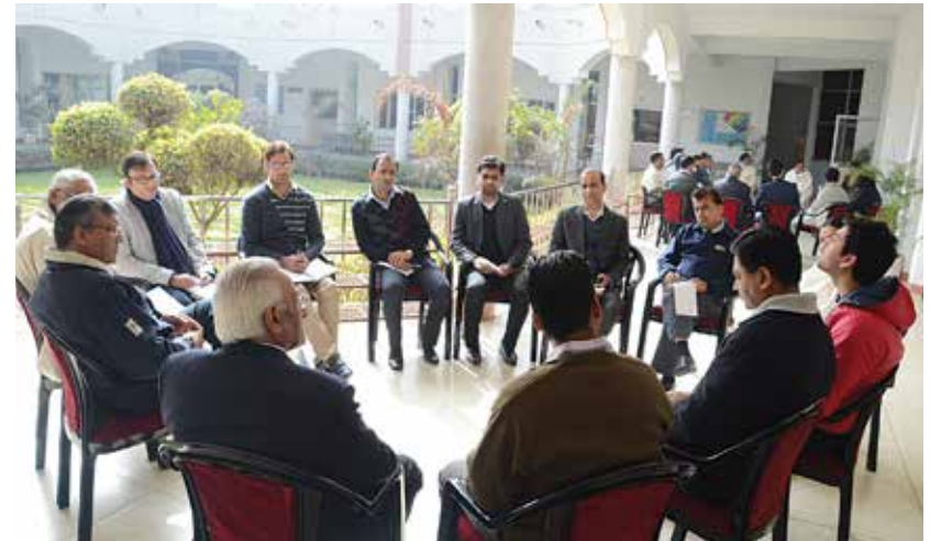
CSR training and dialogue at Om Shanti Retreat Centre, Gurgaon.

It was set up in 2013 to help in the development of rural and tribal regions, with a direct focus on Abu Road and surrounding villages in Rajasthan. It uses innovative channels like digital media and a community radio station to reach out to masses and works in areas of education, healthcare, safety, family values, local art, cultures and customs.