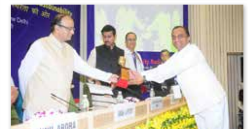
Community Engagement Award from Arun Jaitley, Minister I&B, Finance, India