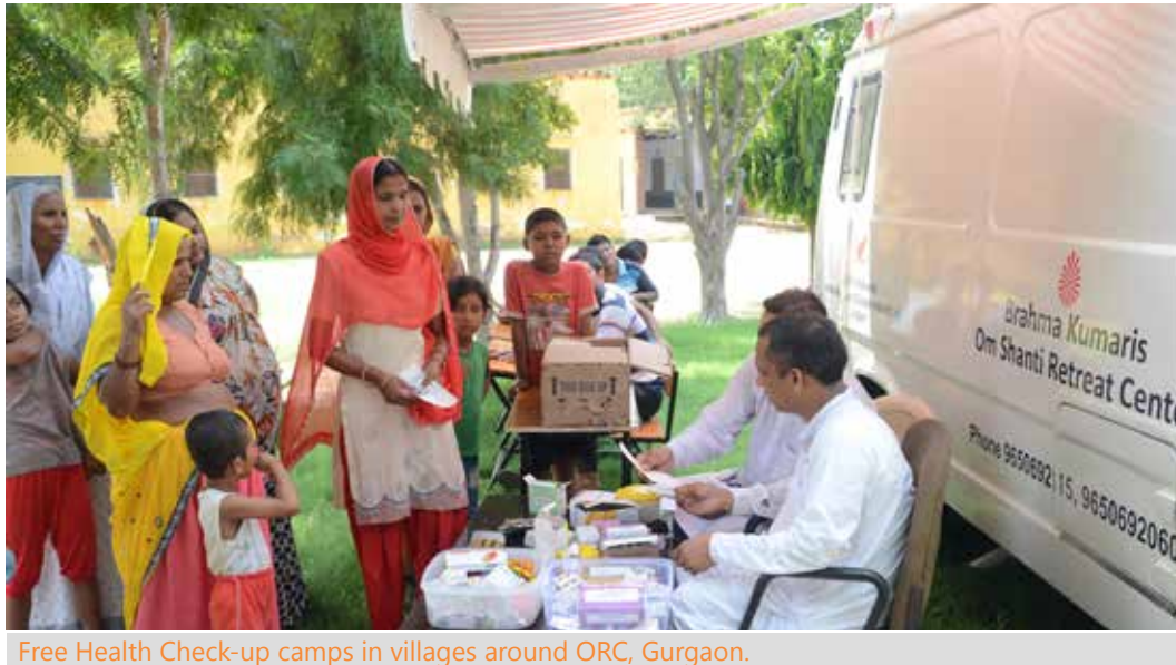
Free Health Check-up camps in villages around ORC, Gurgaon.