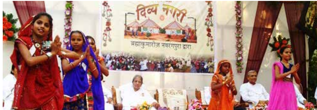
Students of Divya Nagri Project performing at a cultural event.

Camps for health awareness, de-addiction, youth & women empowerment and cleanliness drives are a key feature of these campaigns. These initiatives have significantly improved lives of millions of farmers.