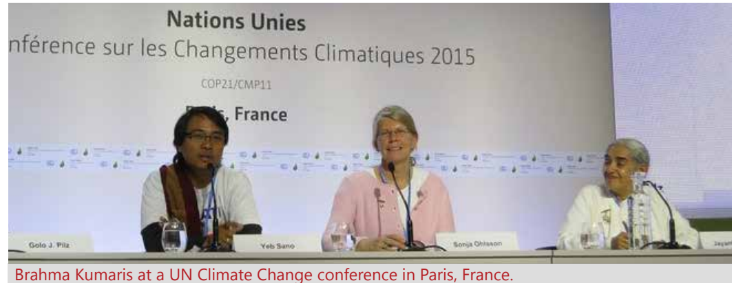
Brahma Kumaris at a UN Climate Change conference in Paris, France.