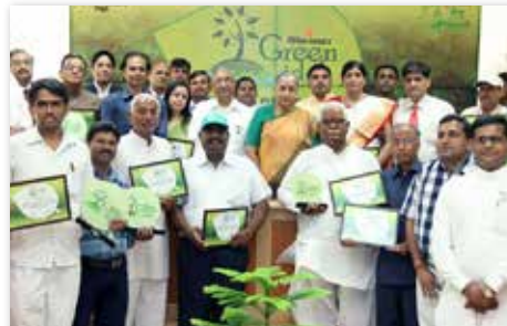
Green Idol Award from Margaret Alva, then Governor of Rajasthan