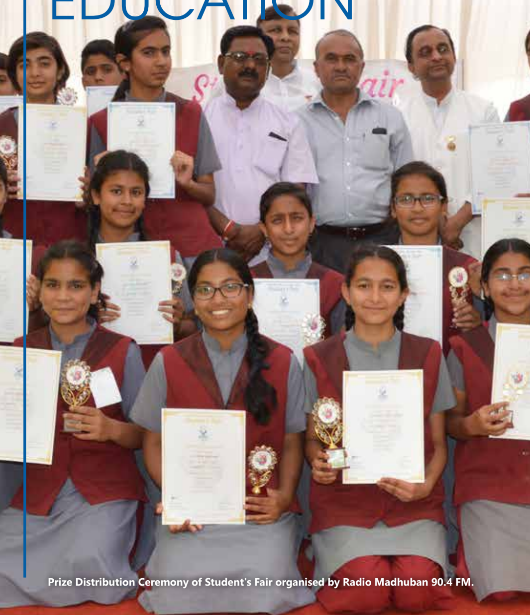
Prize Distribution Ceremony of Student's Fair organised by Radio Madhuban 90.4 FM.