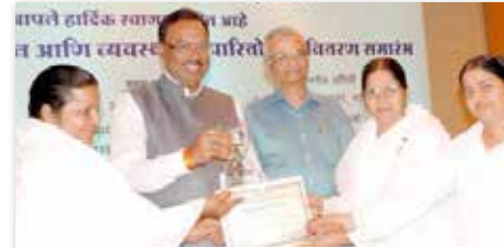
Excellence in Energy Conservation and Management Award from Energy Minister, Maharashtra