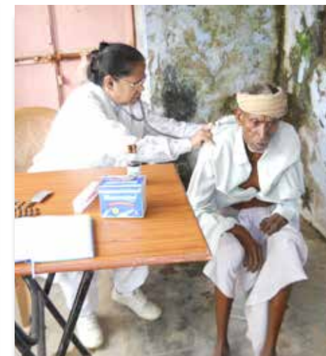
Community health checkup camp.