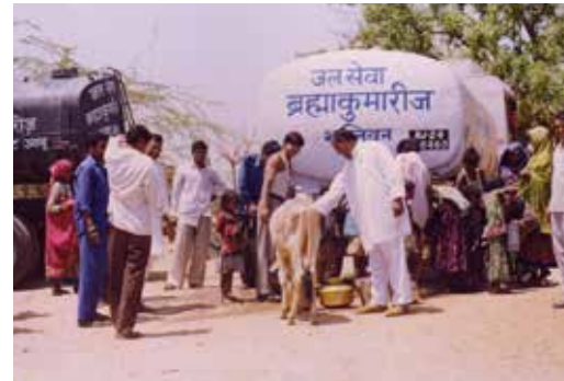
Water support during drought in Rajasthan.