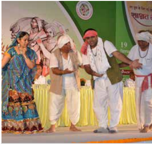
Cultural program during awareness campaign.