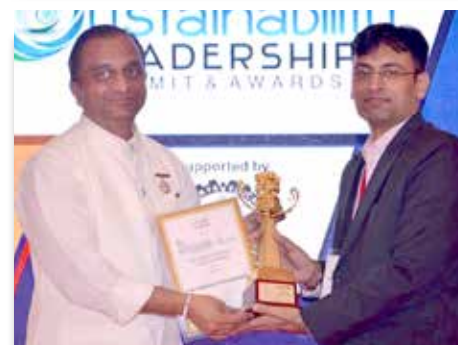
Best Water Infrastructure Award