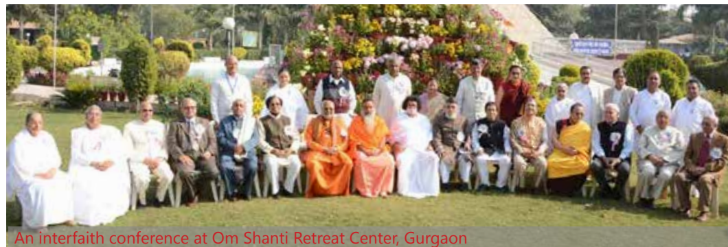
An interfaith conference at Om Shanti Retreat Center, Gurgaon

Tendencies of fear, worry and anger have been known to stress the mind. This jeopardizes life on roads. Therefore, short on-air audio capsules, encouraging promos and meditation commentaries have been designed and produced by Brahma Kumaris that can be played while stopping on traffic signals or driving to sooth and relax the mind, thus enabling a safer road environment.