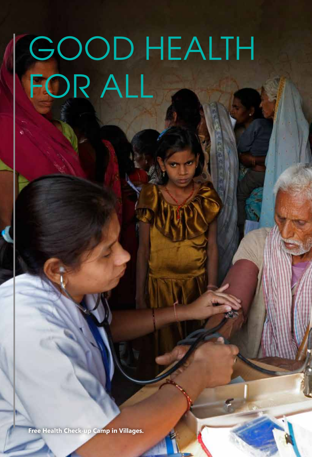
Free Health Check-up Camp in Villages.