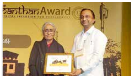
The Manthan Award from Aruna Roy, Indian political and social activist