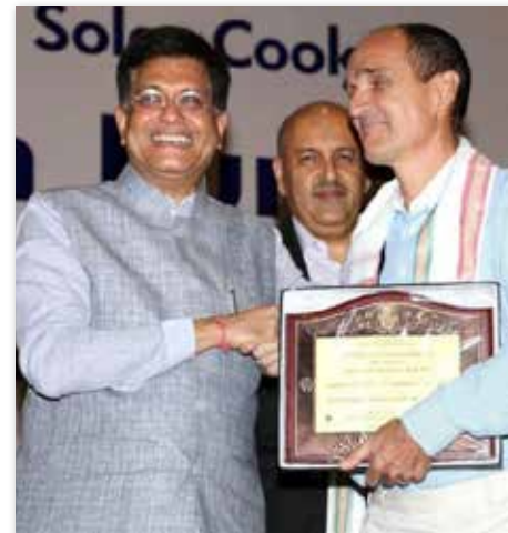
CST Solar Cooker Excellence Award from Piyush Goyal, Energy Minister, India