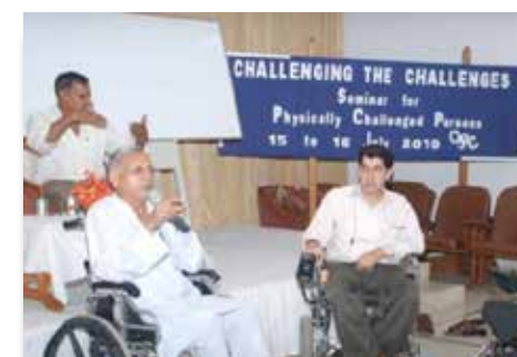
Program for differently abled.