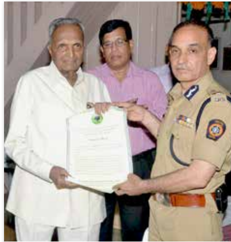
Friends of Tree Award from Commissioner of Police, Greater Mumbai