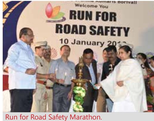
Run for Road Safety Marathon.

their inner world and effectively steer their thoughts, emotions, attitudes and actions to bring benefit to the self and others. The change in stakeholder perspective contributes to better road management systems, safer road users and safer roads.