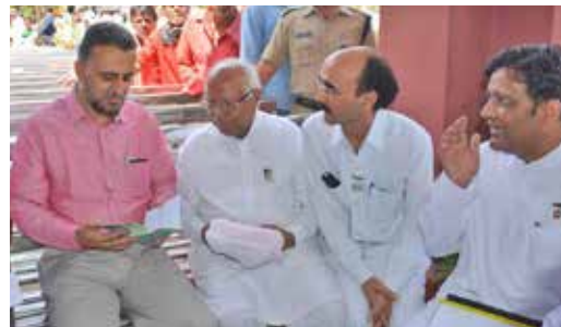
Meeting with railway officials for the project.

The organization has also taken upon itself the responsibility of painting, beautification and cleanliness of the entire station area. A pick and drop facility is also underway to facilitate passenger movement.