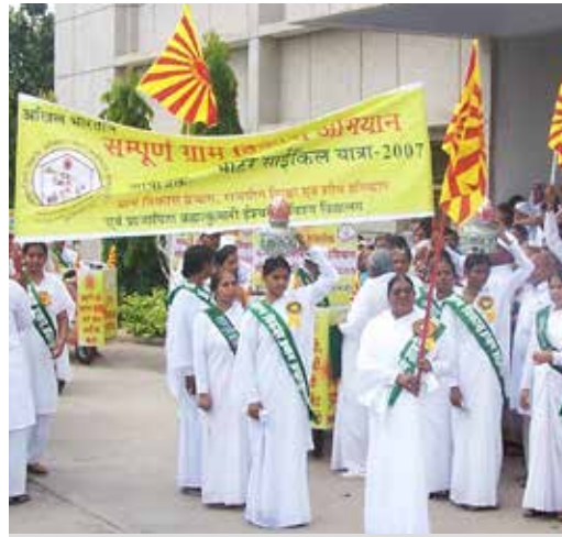
Launch of National Rural Development Campaign.

BECIL also provided a transmitter and FM broadcast antenna in 2016 to ensure continued operations of the station.