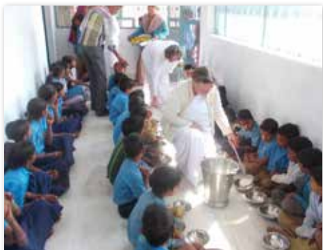
Nutritional support project.