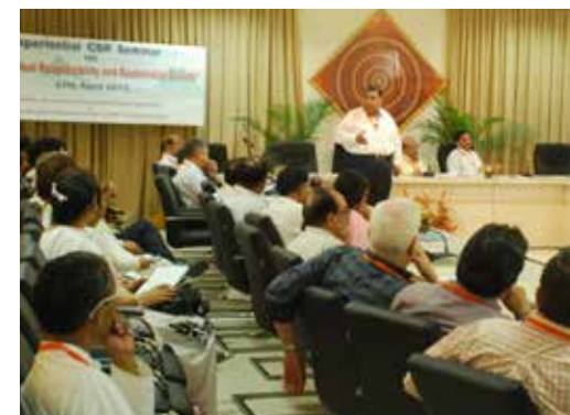
Workshop on Corporate Social Responsibility

'Choose, Change and Become' is a popular retreat for young professionals that brings together people from diverse professional backgrounds over a weekend for focused group workshops. 16 such retreats have been organized since 2010 in Gurgaon, Lucknow, Mumbai and Manipur to benefit more than 2,700 participants.