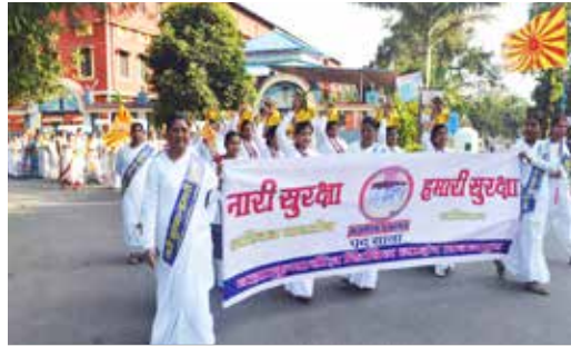
National Women's Safety Campaign 2014

More than 1,45,000 women benefitted from the 45 regional campaigns in 13 states organized under the National campaign