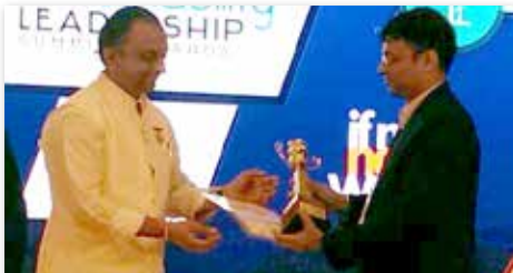
Sustainable Community Leadership