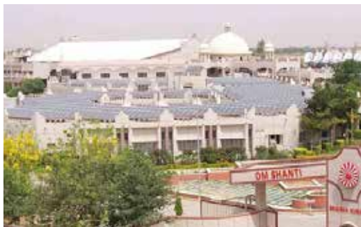
Off-grid solar PV system at ORC, Gurgaon.

In the recent years the organization has installed an additional capacity of 2 MW through more than 300 off-grid solar PV systems at its centers across the country, bringing awareness about sustainable energy among diverse social communities.