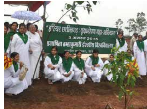
Plantation Drive in Raipur, Chattisgarh.