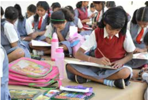
Save Kids Lives Painting competition.

85,830 Child declaration supports collected from 73 countries were collected during the global Road Safety Week 2015.