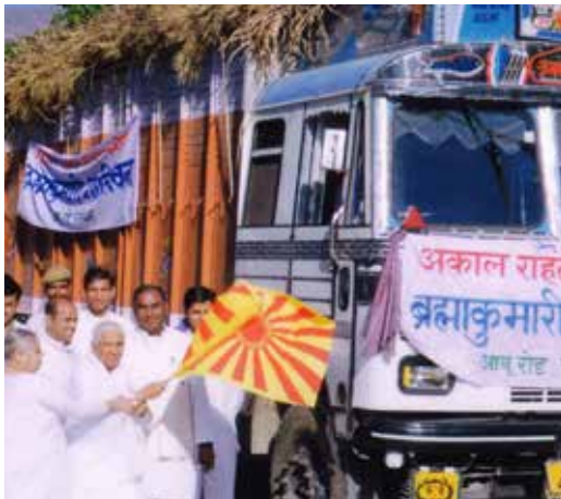
Food Supplies being dispatched during famine.

A 30-bed community health center was also constructed to provide healthcare to the victims and their families.