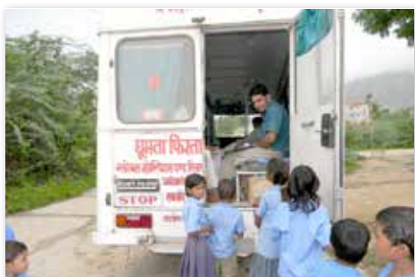
Mobile Ambulance Service in villages.