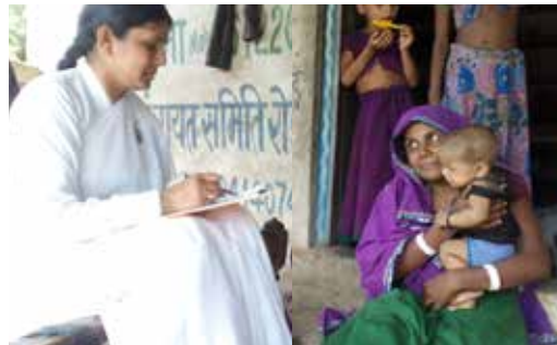
BK Volunteer during an outreach project.

The station has won many awards including National Community Radio Award in 2014 & 2016.