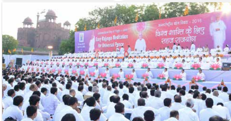
Yoga day celebration and meditation for world peace at Red Fort, New Delhi.