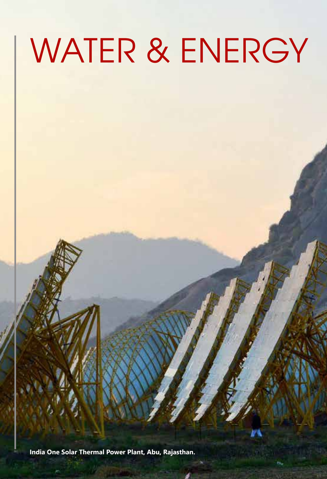
India One Solar Thermal Power Plant, Abu, Rajasthan.

Water conservation and preservation is our top priority. The fact that the spiritual Headquarters of the organization are in the arid region of Rajasthan puts tremendous responsibility to efficiently manage the available water resources.