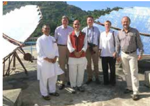
Delegates during training at India One.