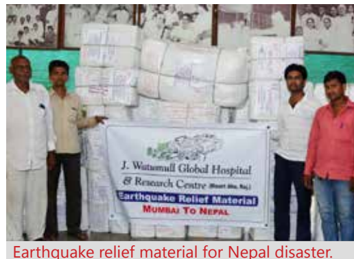
Earthquake relief material for Nepal disaster.

Similar support teams were sent to Chennai in 2015 to carry out relief tasks and help the victims' families.