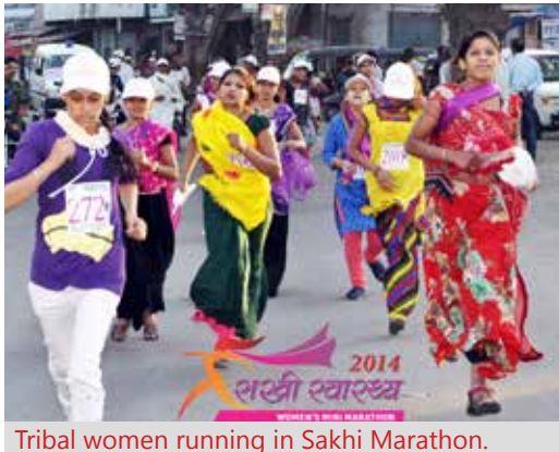
Tribal women running in Sakhi Marathon.

Over 500 events and competitions in arts, music, cookery, sports, theatre etc. are organized for women to encourage cultural development every year and especially during the International Women's Day celebrations.