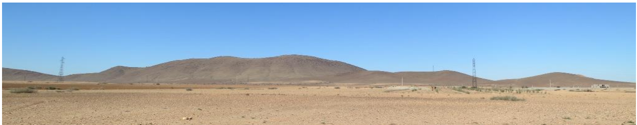
Picture taken on the way to the Earth Forum

The World Meteorological Organization (WMO) published an alarming report on Monday, at the conference, that 2016 will be the hottest year ever on record. According to these scientists, scorching temperatures and extreme weathers are coming sooner and with more ferocity than expected. "It is almost as if Mother Nature is making a statement," said climate scientist Michael Mann, Penn State University, USA.