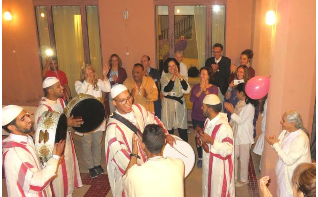
The powerful kitchen team