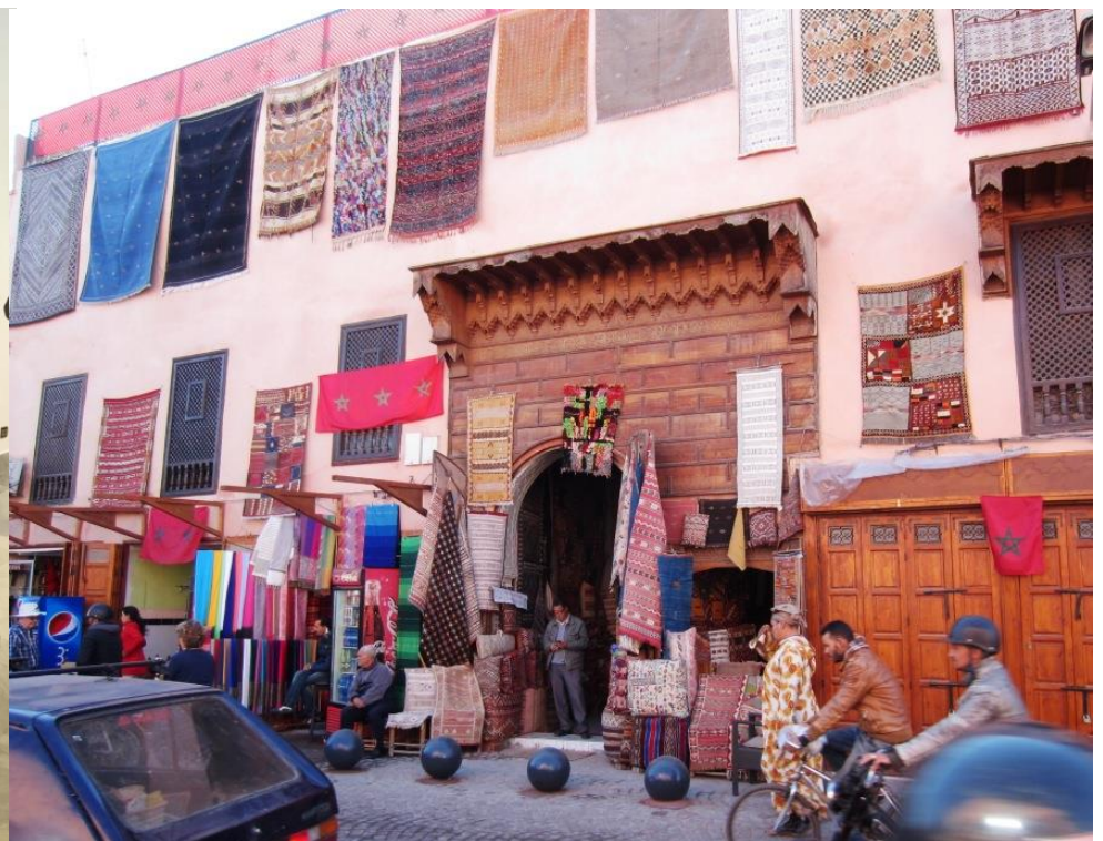
Entry to old town in Marrakech