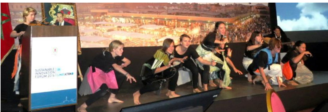
Dance from the Green School at Innovation Forum