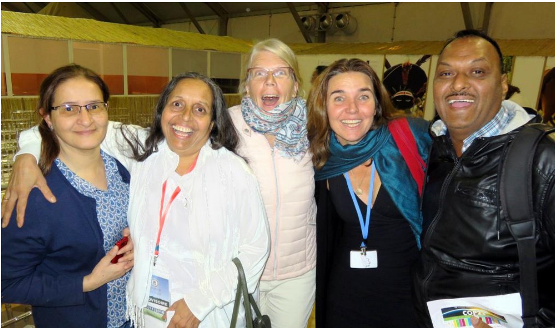
BK delegation happy at the end of the day