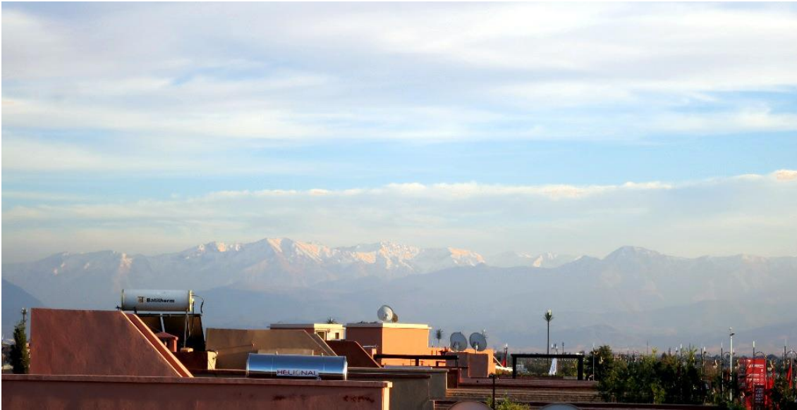
View of the Atlas Mountains in the afternoon