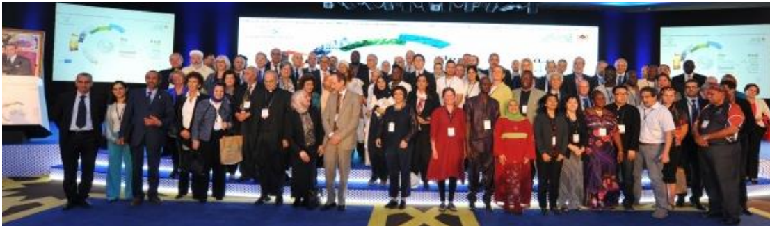
Family photo of the participants to the summit

We all believe in something that is invisible, the afro umbandists are animists whose beliefs go way back, from before Christianity. We believe in the orillas, spirits of nature. This religion has come from the people who came with slavery, they have demonised our religion but we don't even have a devil ourselves. Religions have to act and also have to plea to show the example of our spirituality.