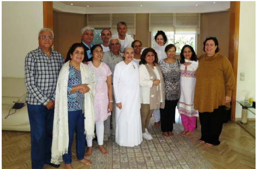
Picture: Morning get together