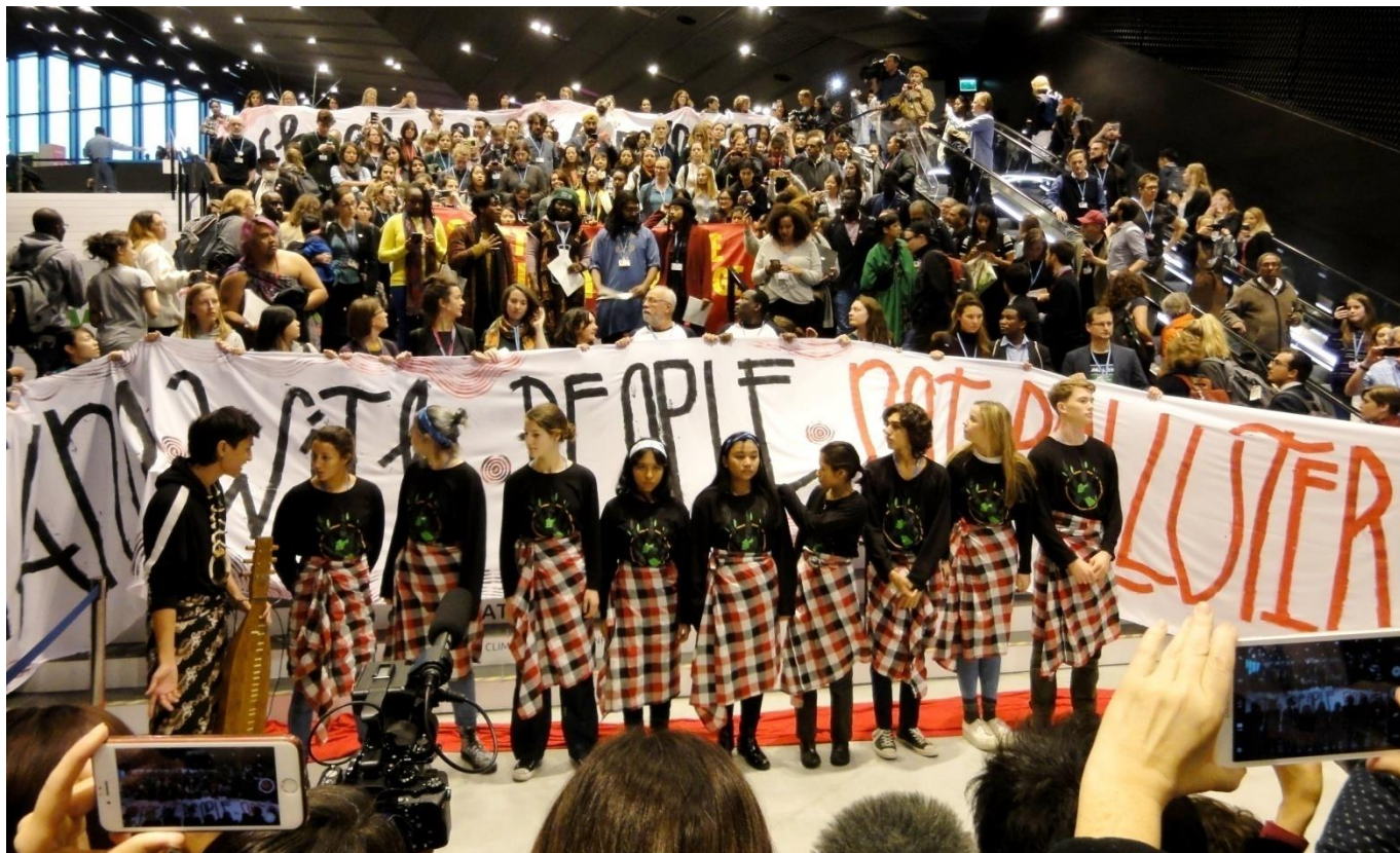
COP24 demonstration with a desperate civil society