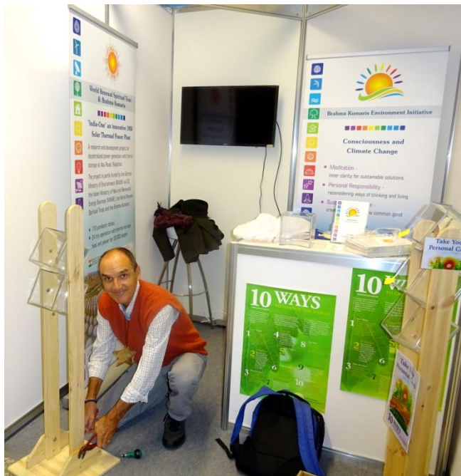
Golo dismantling the stand