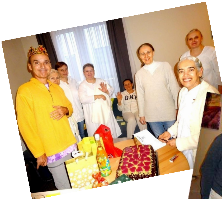
Golo's Birthday party