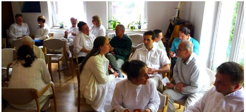
A Green workshop in Warsaw centre, Summer 2018